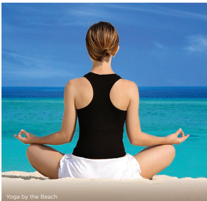
Yoga by the Beach