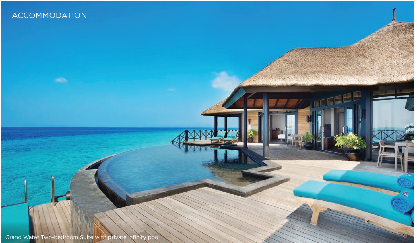
Grand Water Two-bedroom Suite with private infinity pool