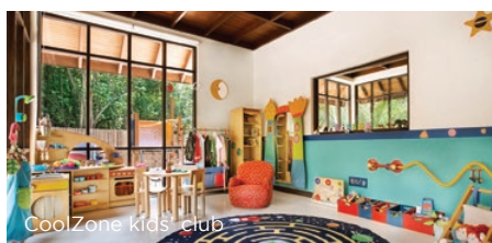
CoolZone Kids' club