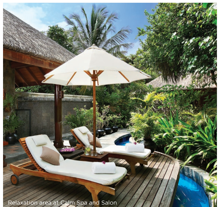
Relaxation area at Calm Spa and Salon