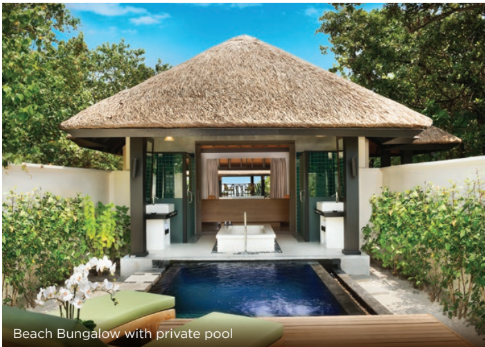
Beach Bungalow with private pool