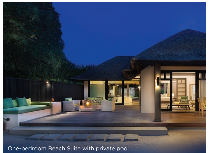
One-bedroom Beach Suite with private pool