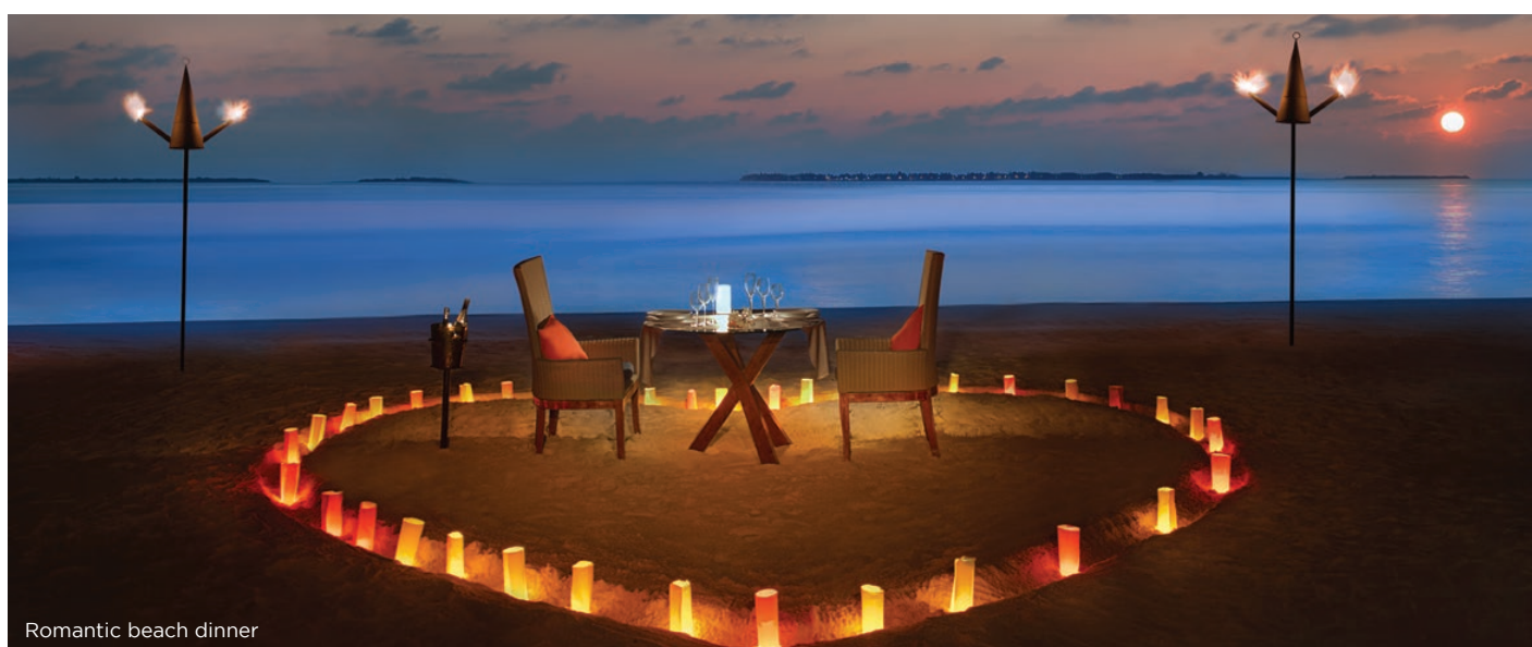
Romantic beach dinner