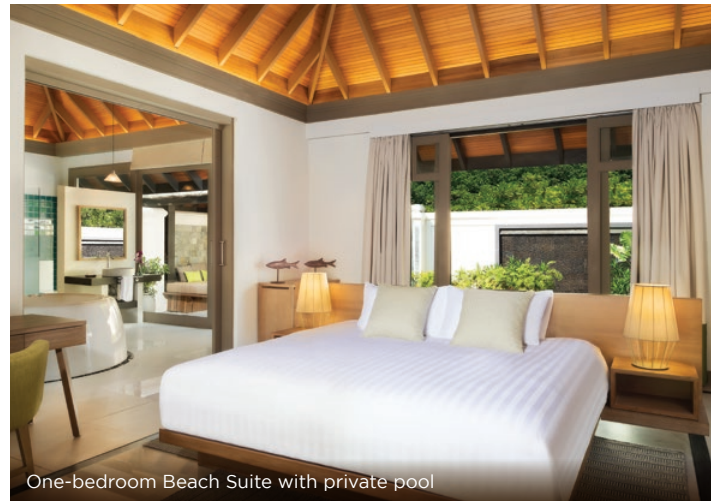
One-bedroom Beach Suite with private pool