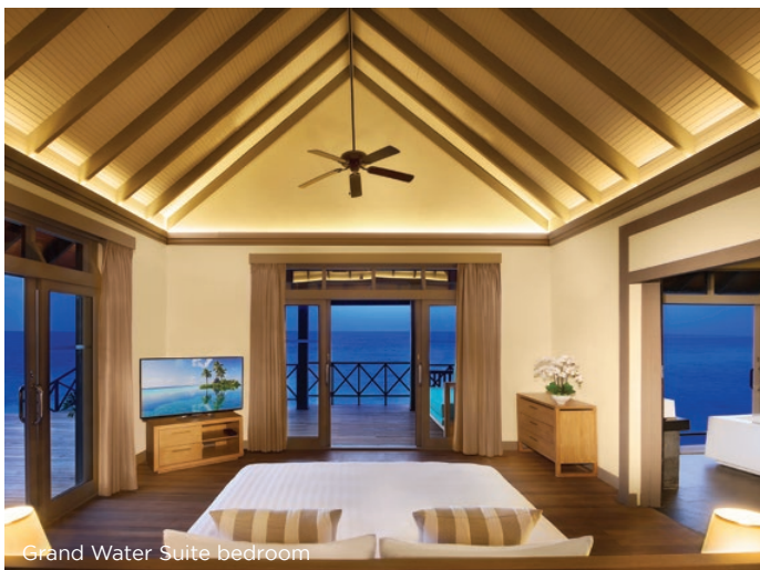
Grand Water Suite bedroom