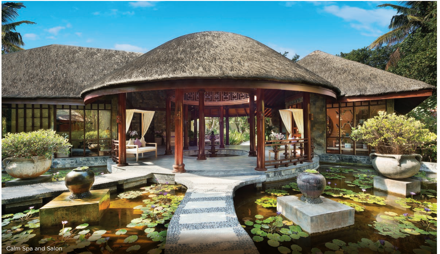
Calm Spa and Salon

Find your chi, meditate in island bliss and discover tailor-made fitness programmes with your very own private instructors at our tropical island pavilion.