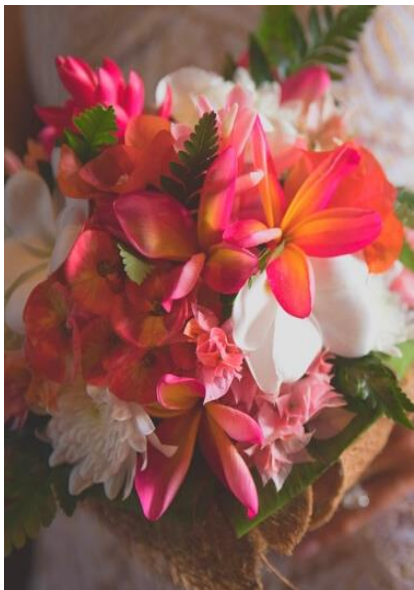
Upgraded Round Arrangement