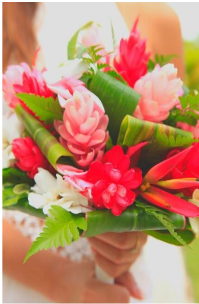
Round Tropical Arrangement