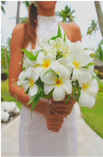
Round Plumeria Arrangement

Upgraded Round Arrangement Rate on request