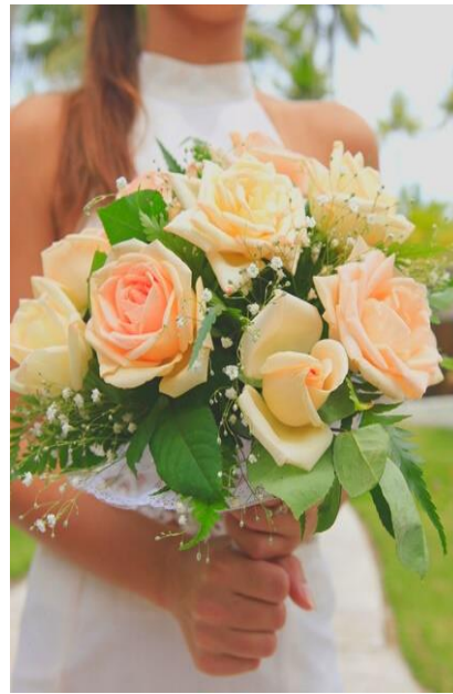
Round Roses Arrangement